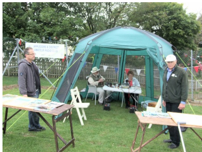
Abbotsham Fete - 2011