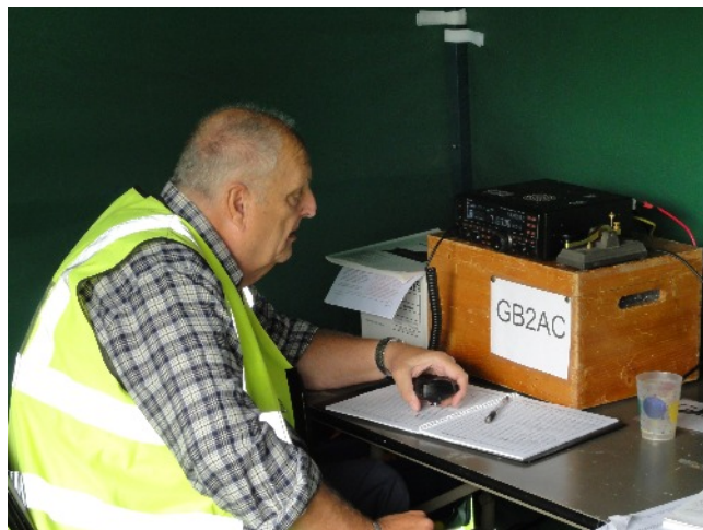
Arlington Court - 2010