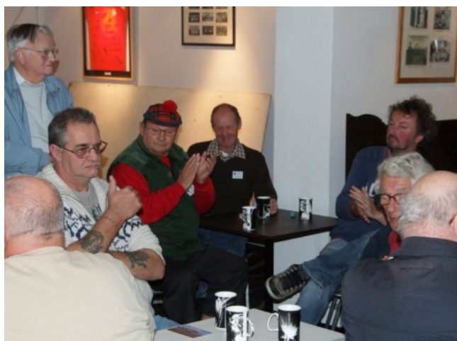
Natter Night - 2011

That's it for this month - hope you enjoy the Newsletter