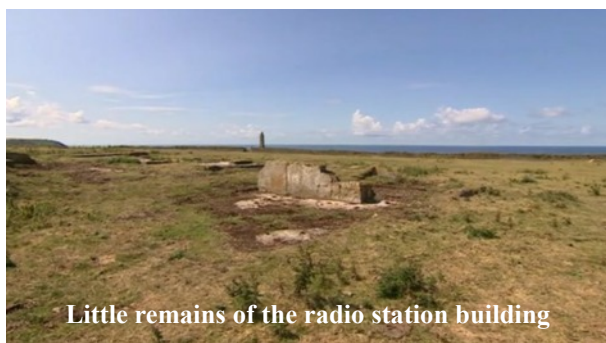
Little remains of the radio station building

The Radio Officers' Association have organised the station at the QTH of the Poldhu Amateur Radio Club and the Marconi Centre.